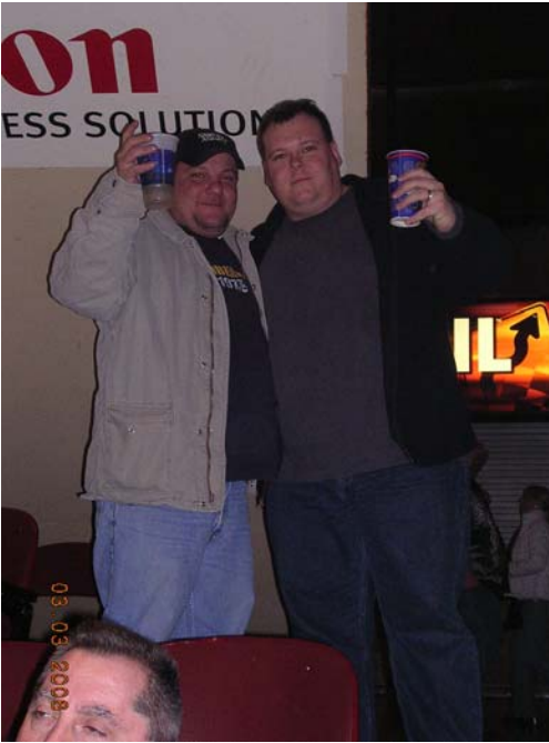
Two of our more inebriated club members!