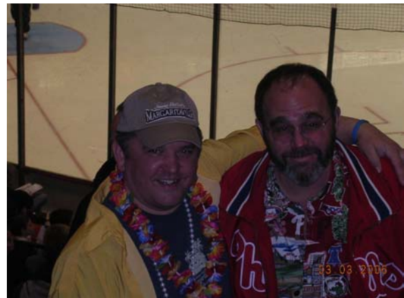
One inebriated club member, and the guy that drove us there!