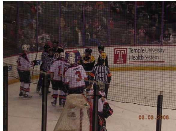
It wouldn't be hockey if there wasn't a fight!