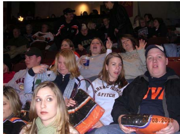
Some of our less inebriated members and guests!

I think our bus trip was a success, in that everyone seemed to have a good time, and we were able to make a profit of $100.00 for the club. The hockey was exciting to watch, and Jimmy and the Parrots put on a very spirited, high-energy show. Our club was welcomed on the scoreboard but we were unable to take a picture in time to prove it.